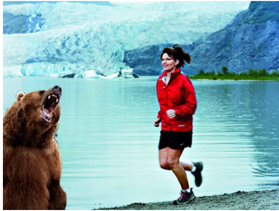
Oh, she'll be running in 2012 alright... just not for president. At least not for a while anyway...

... RUNI RUNI RUNI from front realized that the media didn't want the public to know. Reported one News Corp. insider "I mean we had a good thing going. Sarah would say something crazy and then we would cover it. She still does that really well... what we are going to miss is telling investors she is going to run." Why would News Corp. be making political career choices for Sarah Palin? "Money," went on the source. "There was the whole will-she-or-won't-she but let's face it: every time she goes on air we see a jump in overweight, white, middle aged viewership. If she ran we all